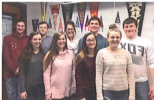
Pictured above are Wyalusing Area Youth Apprentices for the 2016/2017 school year.

The Youth Apprenticeship Program (YAP) is designed to provide students with on-the-job skills and career preparedness in their future career field. NTIEC currently has 104 students apprenticing with 94 employers for the 2016/2017 school year. One leading employer has hired well over 200 full time employees over the years. Consequently, the employer has had a career savings of over $100,000 per employee hired through the YAP program.