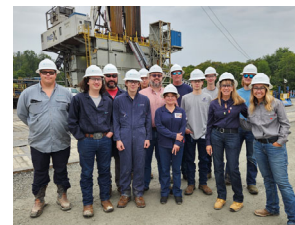
Students visited a rig and spoke with crew members from Coterra Energy