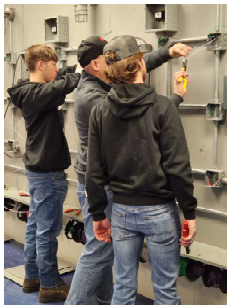
Students get hands-on training from a professional